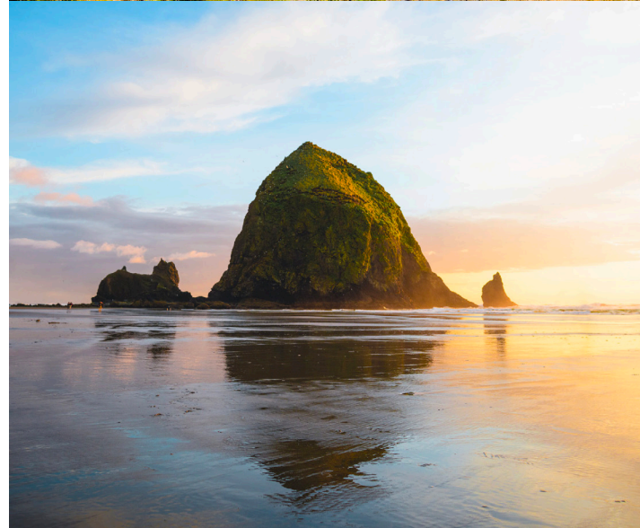
Sisters( Top), Bend (top center), Smithrock (bottom center), Haystack Rock (Bottom)