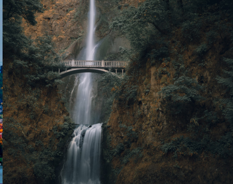
Hood River, OR, left Multnomah Falls, right