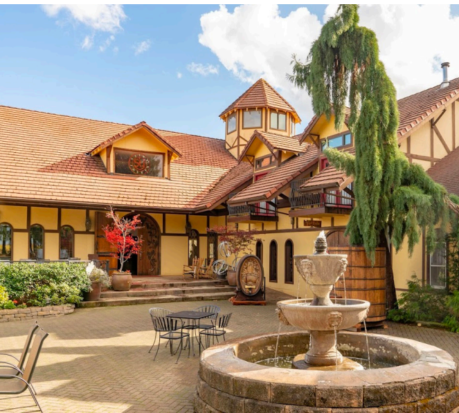
St Josef's Winery

This is just a small number but there are hundreds of wineries and vineyards to choose from in the entire state of Oregon. If you are looking to do a fuller day of winetasting, we suggest visiting Dundee or McMinnville, but you won't go wrong pretty much anywhere in the Willamette Valley. Silverton and Oregon City are also both fun towns with lots of great bars, restaurants, and shopping in their downtown areas.