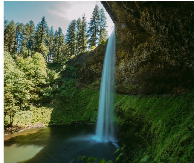
Silver Falls State Park

Best mini-golf in the area! Newly remodeled and now there is a bar inside as well. There is also go-karts, bumper boats, zipline, bowling, and other games.